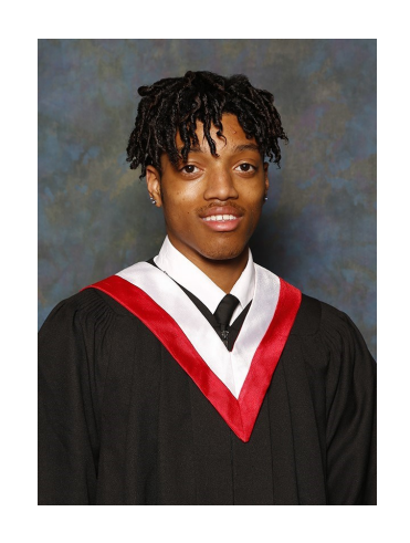
2019 Eaton Graduation