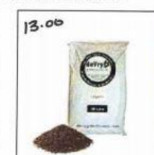
Premium Soil 30 L

A bag of organic potting soil, perfect for filling containers. This hearty mix helps plants grow to their full potential. Enriched with: compost, kelp, fish meal, peat moss, glacial rock dust, & rice hulls.