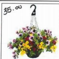
12" Premium Hanging Baskets

Our improved flower mixes are sure to be a big hit! These hanging baskets can be exposed to full sun with the best flowering and trailing plants. There are a variety of mixes/colours.