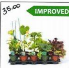
10-pack 4" Veggies

Grow your own food this year in a garden or planter box! Varieties include: