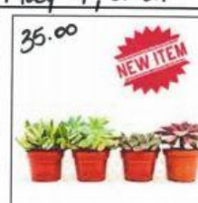
10-pack 4" Succulents

A kid favourite! Enjoy fresh strawberries all summer long. Ever bearing strawberries with different coloured blossoms in white or pink. Beautiful and delicious!