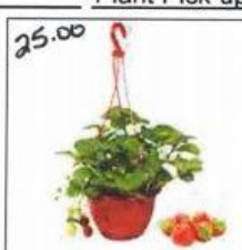
12" Strawberry Basket

All planters include an assortment of our top performing plant collections. Planters can be exposed to full sun areas. Perfect for creating a spring patio or backyard paradise.