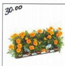
10-pack 4" Marigolds

Colours: Purple, White Cannot mix & match colours in a flat