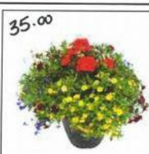
12" Premium Patio Planters

Our improved flower mixes are sure to be a big hit! These hanging baskets can be exposed to full sun with the best flowering and trailing plants. There are a variety of mixes/colours.