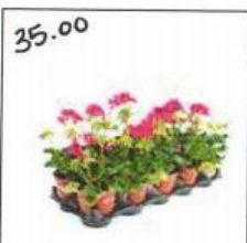
10-pack 4" Zonal Geraniums

These easy to grow bedding plants add vibrant colour to your garden. Resistant to pests such as deer/rabbits.