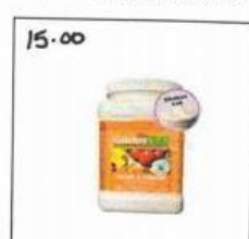
Fertilizer Shaker 1.8 kg

A bag of organic potting soil, perfect for filling containers. This hearty mix helps plants grow to their full potential. Enriched with: compost, kelp, fish meal, peat moss, glacial rock dust, & rice hulls.