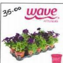
10-pack 4" Wave Petunias

Colours: Red, White, Pink Cannot mix & match colours in a flat