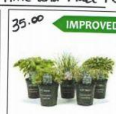
10-pack 4" Herbs

Fast-growing in popularity, succulents are versatile & low maintenance. Ideal as house decor and gifts! This 10-pack offers excellent variety and textures from the echeveria, sedum, sedeveria and senecio families. Duplicates & substitutes may occur.