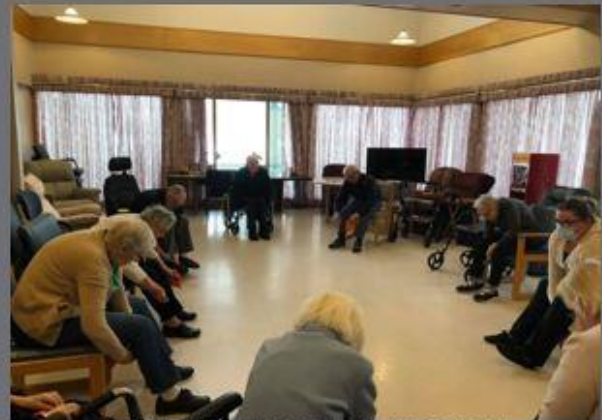
RESIDENTS ENJOYING EXERCISES!!

WE WERE SO GRATEFUL TO BE PART OF THE VACCINE ROLL-OUT ON FEBRUARY 8 TH ! ALL THE RESIDENTS AND MOST OF THE STAFF WHO WANTED THE VACCINE WERE ABLE TO GET THE FIRST DOSE THAT DAY! WE PRAY IT IS THE BEGINNING OF THE END OF THE PANDEMIC AND ALL OF THE RESTRICTIONS THAT GO WITH IT!