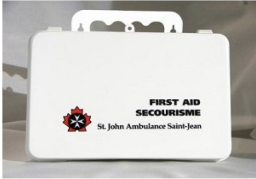
Saskatchewan Provincial Workplace Level 1 Plastic Kit

Each First Aid Kit Includes the following: