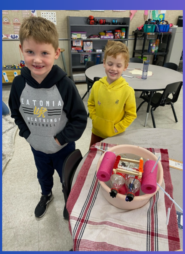
Maddox and Raylan's boat